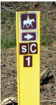
Typical Allegan County Equestrian Trail Marker. You will find these markers along the trails and at trail junctions.